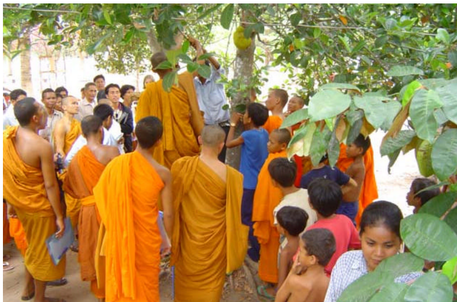
A demonstration of fruit tree grafting techniques for villagers and monks in the grounds of a Kampong Thom pagoda. The trainer is a lay member of the monastery who received specialist training through the provincial Forestry Department. The monastery is a member of the Model Pagoda Project.

This session combined the complementary work of the newly established Association of Buddhists for the Environment (ABE) and the 'Model Pagoda Programme' that has been developed by Mlup Baitong, a Cambodian environmental NGO. Both of the projects have involved the partnership and support of ARC and the World Bank Faiths and Biodiversity Programme.