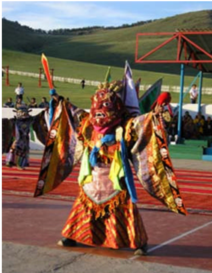
Tsam dancing performed at the mini-Nadaam hosted by President Enkhbyar for the conference delegates on the evening of the opening day

created visual and written resources including tapes, videos, posters and a training manual to support pagodas who wish to participate. Pagodas receive advice and guidance on the following issues: waste and water management, nursery and forest management, installing fuel efficient cook-stoves, education and wildlife programmes and training in management and accountancy. Pagodas can also access information through the ABE that will enable them to find appropriate support through local NGOs or to receive training through government forestry and fisheries departments.