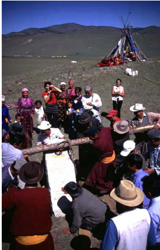
A stela to denote sacred land being erected near Amarbayasgalant monastery as part of a partnership environmental programme between Amarbayasgalant, WWF Mongolia, the World Bank and ARC

a reforestation program to train the young monastic community of the Khan Khokhi region.