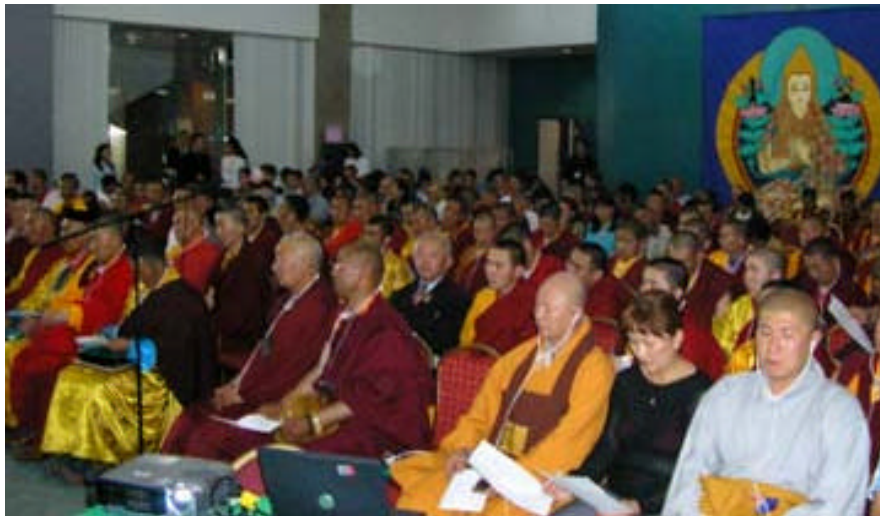
Delegates gathered for discussion of the final recommendations. Interesting detail: It is not allowed to have a Buddha image in the rear of the hall, making everybody turn their back to the Buddha. Luckily the monks from Gandan were able to find an embroidery of a Buddhist deity that was almost completed, but not just yet and thus technically not yet a sacred image.