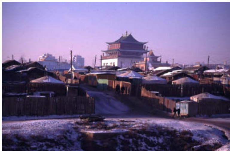
Part of the Ger District in Ulaanbaatar with the roofs of Gandan monastery in the background

The workshop addressed the need for accountability and improved management in relation to urban waste treatment. There is a need to involve the local community in this process whereby a system is created with the local community and education materials and training are disseminated amongst adults and in the secondary school curriculum. Waste disposal and treatment campaigns need to be specifically targeted via media, through colleges, in monasteries and through Buddhist rituals such as those related to ovoos and sacred sites.