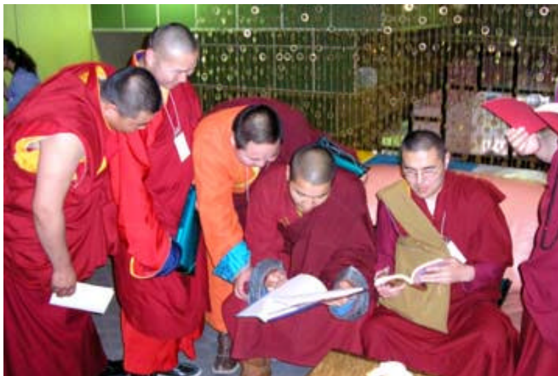
Conference recommendations were discussed amongst a range of groups prior to their presentation at the final conference session