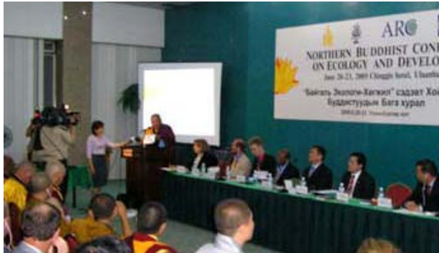
Khamba Lama Choijamts addressing the delegates on the final day of the conference. The first and final day's conference proceedings were covered on national Mongolian television and received daily printed press coverage

Khamba Lama Choijamts responded that natural conservation is one of the specific missions and objectives of Buddhism. He pointed out that the knowledge of older people is disappearing and traditional knowledge is held by a few. The community needs to be enlightened in relation to religious issues. He said that preserving a mountain is not just about a festival to worship the mountain, but about continual environmental care. The true aim of sanctification is to respect and glorify the non-physical masters of that entity. The Khamba Lama emphasised the need for monks to be carriers and disseminators of this wisdom to prevent exploitation the earth's 'free gifts' such as minerals, rare animals and water sources. The Khamba Lama addressed the conference saying 'we must become true owners, we should be the people who revive and glorify the earth, to protect it from maltreatment. The monasteries and territories of Mongolia are divided into regions and each should be handled and trained clearly. People need to know the story of the earth and of their sacred sites'.