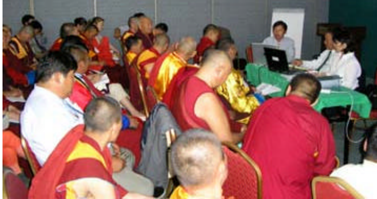
Delegates attending the workshop on Pollution

Water, Forestry and Reforestation, Mining, Pollution (Solid Waste and Air Pollution), Urban Issues, Pasture management and wildlife conservation