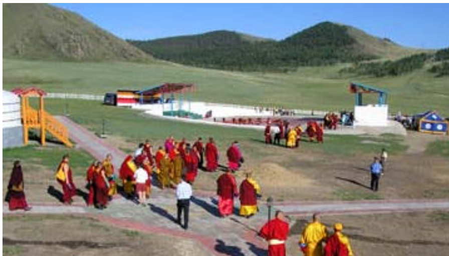
Conference delegates were welcomed with a mini-Nadaam hosted by His Excellency, Mr. Nambar Enkhbayar, President of Mongolia and International President of ARC

"We understand that conserving nature through human being's mind, soul and religion is progress. You just know that giving planting idea of conserving nature into people's soul will work."