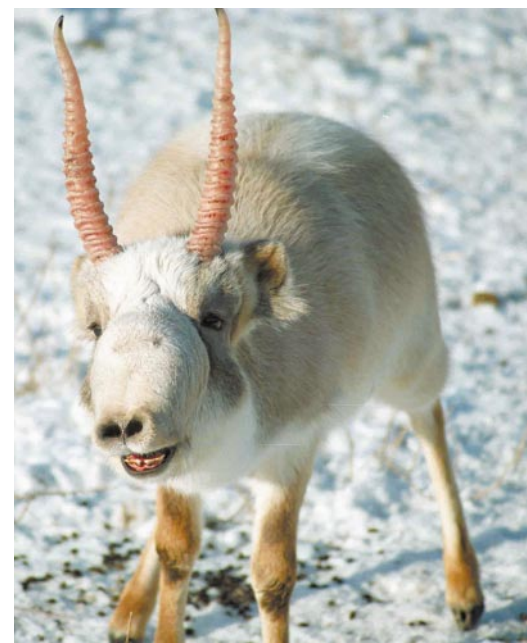
Figure 1 Male saiga antelopes have been so ruthlessly hunted that their breeding and populations have been severely disrupted.

Anecdotal observations of S. tatarica tatarica in the 2000 rut point to a complete reversal in reproductive behaviour. Normally, an adult male defends a harem of 12–30 females 9,10 . In 2000, however, single males