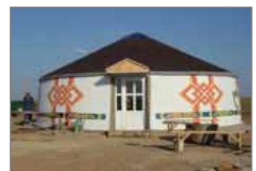
New visitor centre at the Yashkul breeding centre, Kalmykia.

See: http://usembassy.ru/embassy/releaser.php?record_id=48