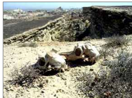
Saiga skulls with cut off horns on the Eastern escarpment of the Ustyurt plateau.

Sergey Naumov Full version at: www.tribune-uz.info