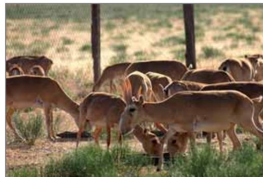
Saigas are fed mineral additives, vitamins and concentrates before birth in their enclosure.