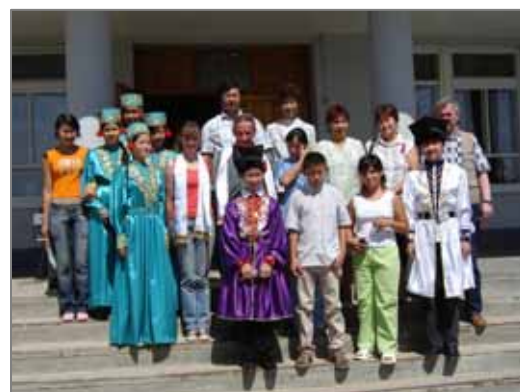
The pupils of Yashkul grammar school are friends of the captive breeding centre.