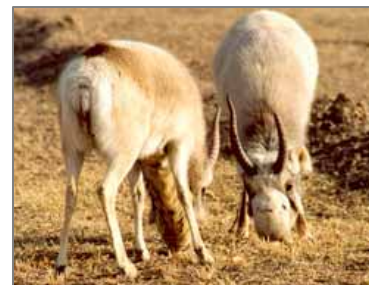
Saiga males fighting, observed at the Gansu Breeding Centre.