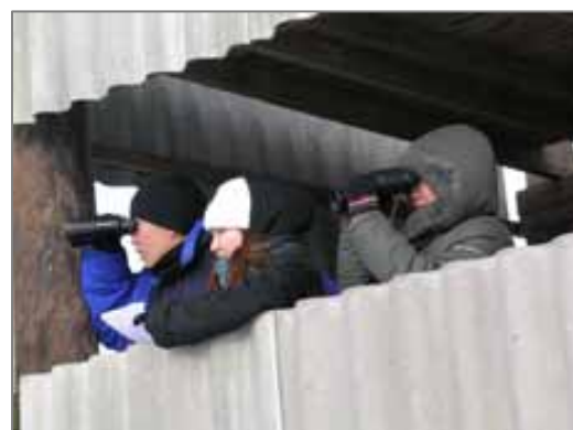
Observation of the rut by students of the Biological Faculty of the State University of Kalmykia.