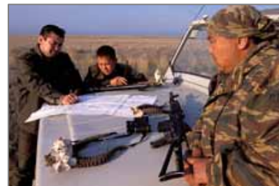
Group of rangers.

Since the beginning of the year, 7 incidents of poaching have been uncovered in Kazakhstan. Criminal proceedings are being instituted. The regional court of the Shalkarsky area delivered a verdict on 2 Uzbekistan citizens in June 2005. They were found guilty of illegal hunting on the Ustyurt plateau in Kazakhstan. Despite the existence of a ban on saiga hunting, these men killed 9 saigas, for which they were sentenced to 2 years imprisonment and a fine of 1.4 million tenge (approximately US$ 10.4 thousand). See: http://www.earthwire.org/kz/account.cfm